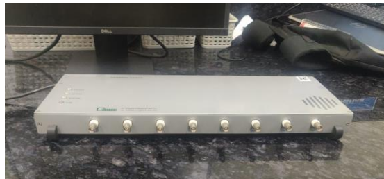
Figure 1. Existing data acquisition system( the dynamic amplifier/analyzer must be compatible with the existing DAQ