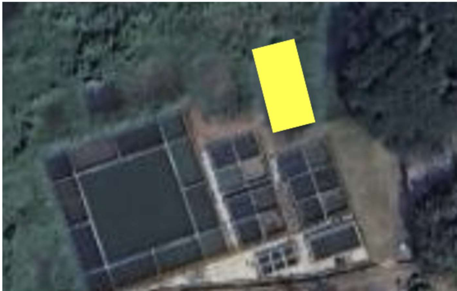
location: College of Fisheries, mangaluru

2 x USB 3.2 Gen 2, 2 x USB 2.0), Power Supply: 500W or higher. The location, depicted in the image below, measures 13ft X 48 ft and should include essential stone pitching and access for conducting experiments.